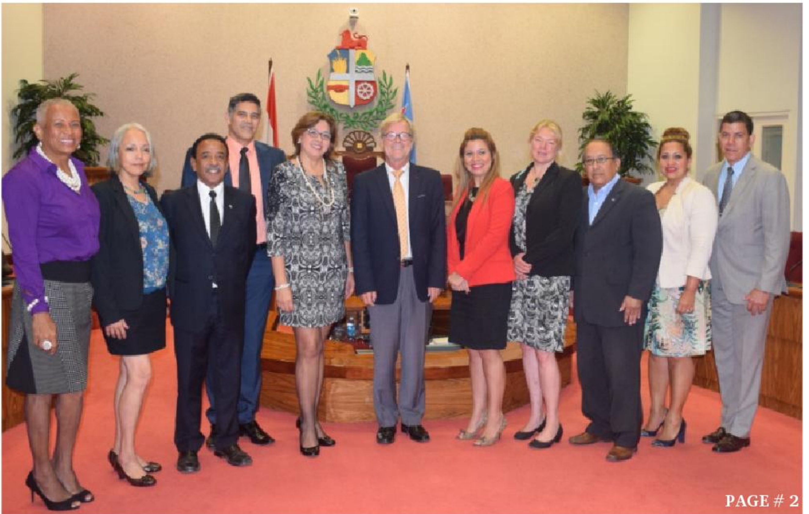
PAGE # 2

COMPULSORY EDUCATION IS NOT THE SAME AS SCHOOL ATTENDANCE